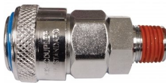
F940 High-Flow One Touch System Air Fittings