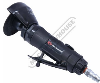
Low Rear View