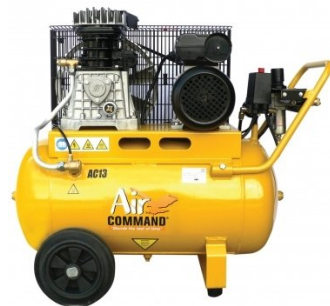
C3118 Air Compressor