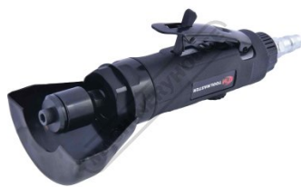
Shown Without Disc