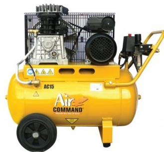
C3120 Air Compressor