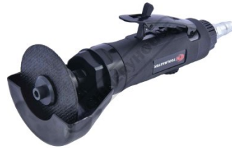
Shown With Disc