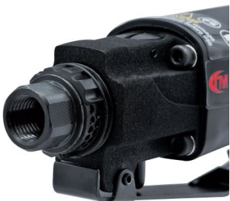
Air Inlet Close Up