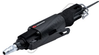
Rear View Shown with Air Fitting