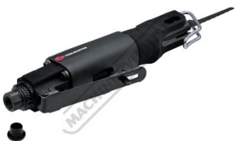
Rear View With Plug Removed