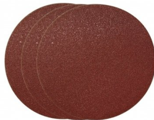
A5335 120G x 178mm (7") Aluminium Oxide Sanding Disc Pack