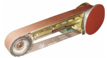
L088 Multitool Belt & Disc Linishing Attachment