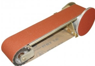
L089 Multitool Belt & Disc Linishing Attachment