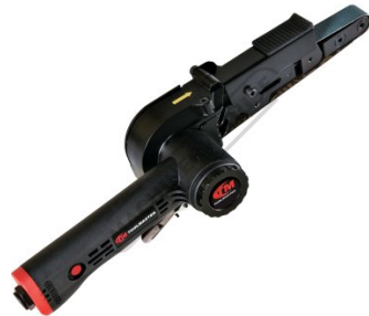
20 x 520mm belt size