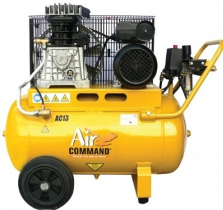
C3118 Air Compressor