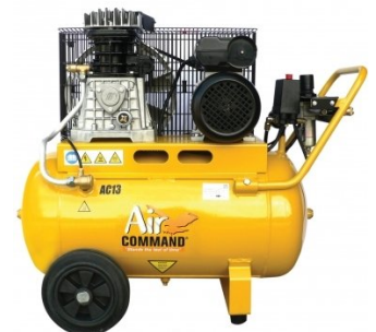
C3118 Air Compressor