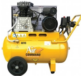
C3120 Air Compressor