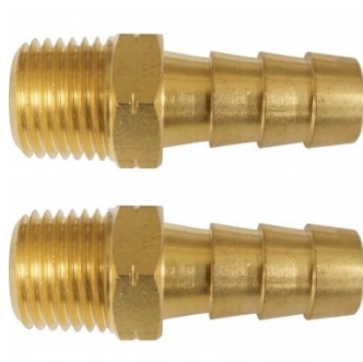
F803 Air Fittings