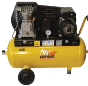
C3122 Air Compressor