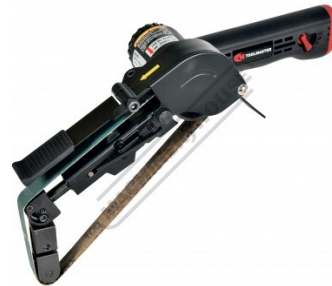
Swivel Belt Arm