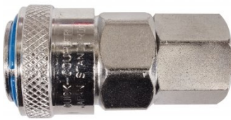
F945 High-Flow One Touch System Air Fittings