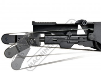
Bendable arm to 55 degrees