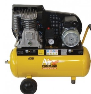
C3124 Air Compressor