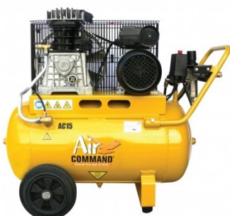
C3120 Air Compressor