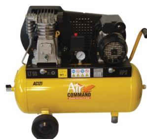
C3122 Air Compressor