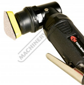
Mini Triangular Sanding Disc