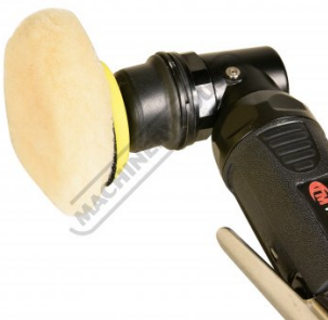
Large Wool Pad