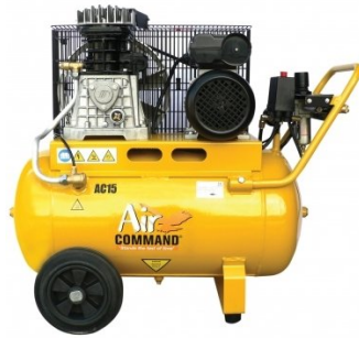
C3120 Air Compressor