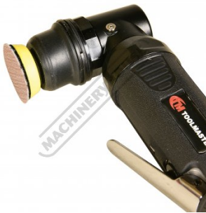
Small Round Sanding Disc