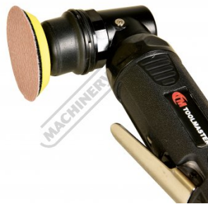
Large Round Sanding Disc