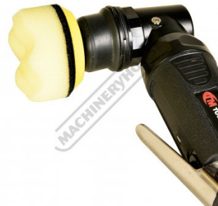
Large Polishing Pad