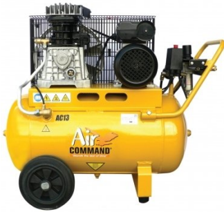
C3118 Air Compressor