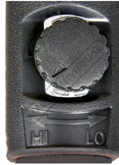
Power Speed Adjustment