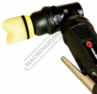
Small Polishing Pad