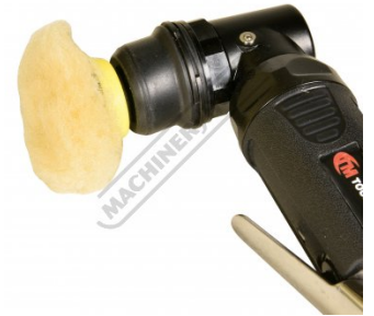
Small Wool Pad