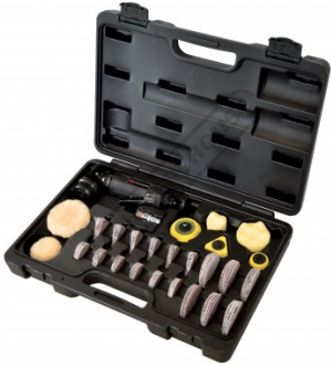
Air Sander Case