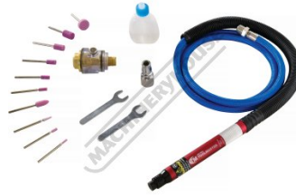
Twist Throttle Variable Speed Control Kit