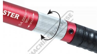
Twist throttle VARIABLE SPEED CONTROL