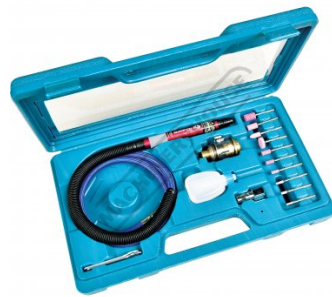
Shown In Plastic Case