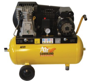
C3122 Air Compressor