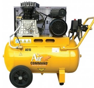
C3120 Air Compressor