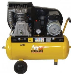
C3124 Air Compressor