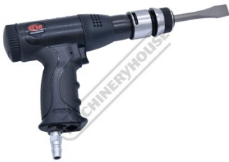
Quick Change Chuck Setup 1