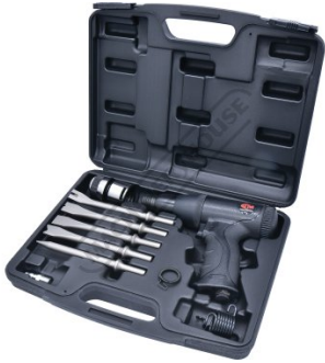
Show in Case