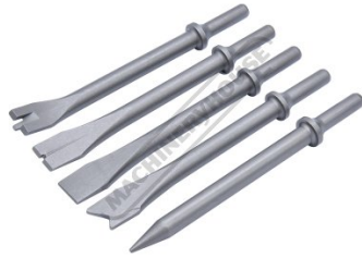
Round End Chisel Set