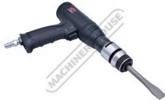
Quick Change Chuck Setup 2