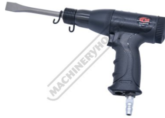
Coil Spring Setup 1