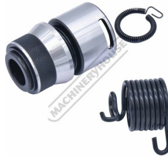
Coil Spring and Quick Change Chuck