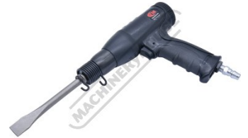
Coil Spring Setup 2