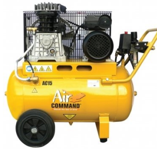
C3122 Air Compressor