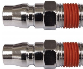
F951 High-Flow Air Fittings