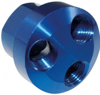
F882 Air Fittings