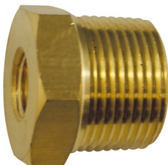
F838 Air Fittings