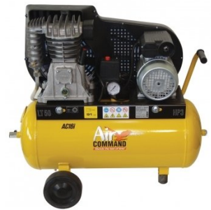
C3124 Air Compressor