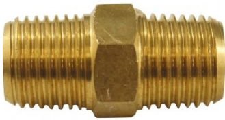
F860 Air Fittings