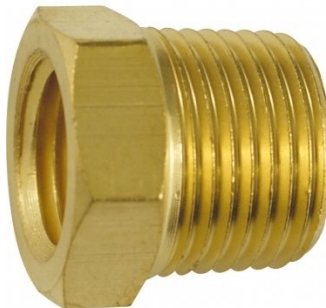
F832 Air Fittings