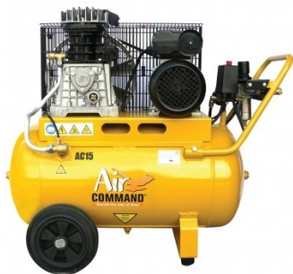
C3120 Air Compressor