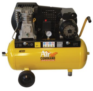
C3122 Air Compressor