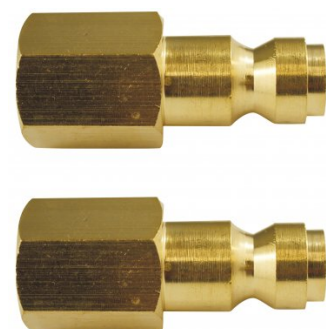
F903B Air Fittings