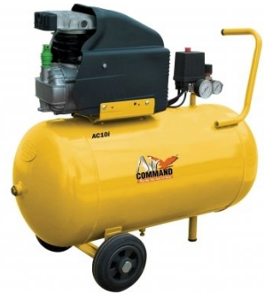
C3116 Air Compressor