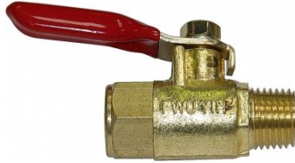
F930 Air Fittings