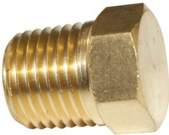
F870 Air Fittings