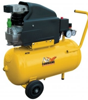
C3114 Air Compressor