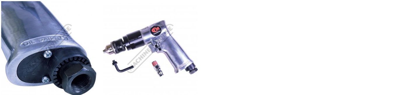
Quiet Handle Exhaust