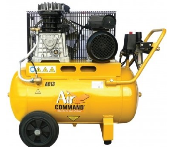
C3118 Air Compressor