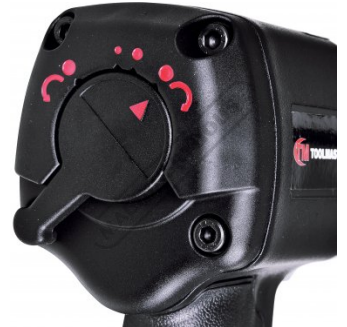
3 Forward and 1 Reverse Speed Selector