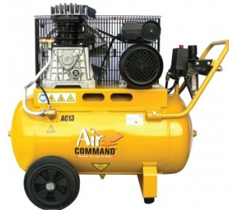
C3118 Air Compressor