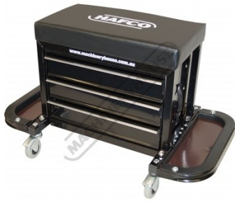
Side Trays Shown Down