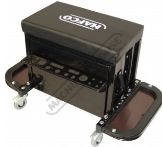
Rear Tool Storage Support