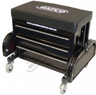
Side Trays Shown Folded Up