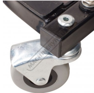
4 x Swivel Wheels