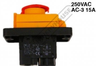
2BC0226 Switch 250V Side View