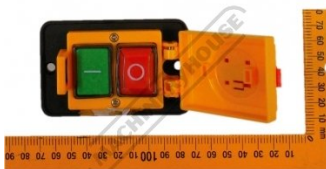
2BC0226 Switch 250V Lid Open