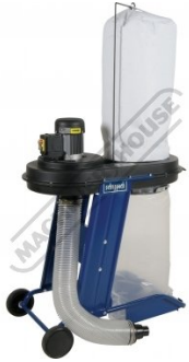
Right Rear View