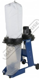
Front Right View