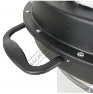
Handle For Easy Manoeuvrability