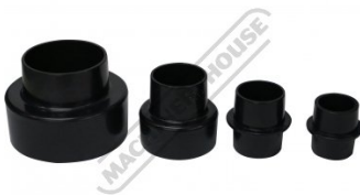
Individual Step Reducers Shown Apart