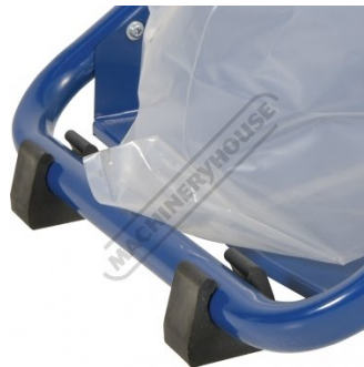
Front Floor Stops