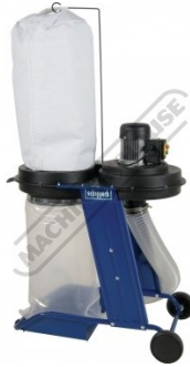
Left Rear View