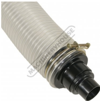
100mm Hose With Reducer