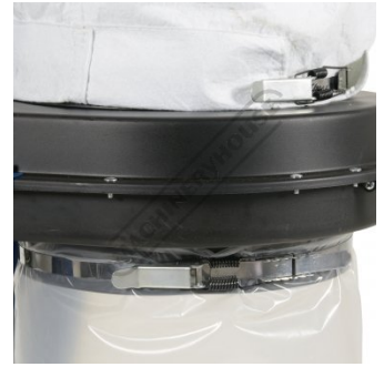
Quick Action Clamps