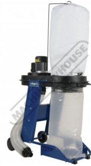
Left Front View