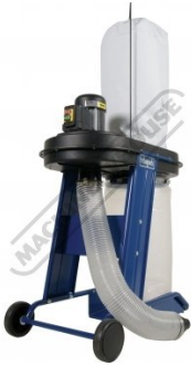
Rear Low View