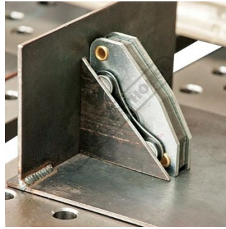
W1011 XYZ Magnet Squares - Multi- Angle - (2-Pack)