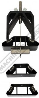
W114 3 Angles Welding Aluminium Clamp Set