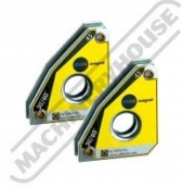
W1009 Mini Magnet Squares - (2-Pack)