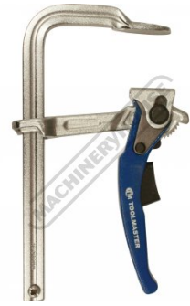
C0010 Ratchet F Clamp