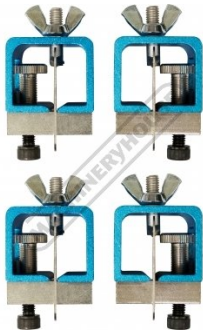
W113 Butt Welding Aluminium & Steel Clamp Set