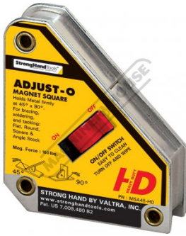
W1006 Adjust-O Magnet Square - Heavy Duty