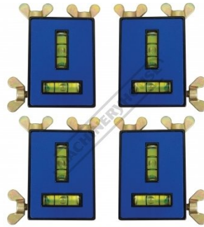
W115 Precision Welding Aluminium Clamp Set