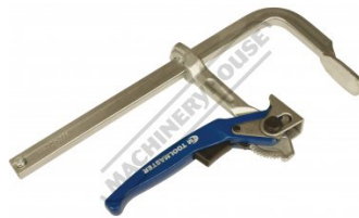
C0013 Ratchet F Clamp