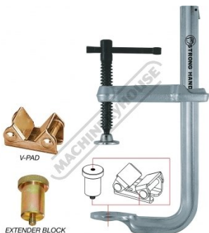
W1027 4 In One Utility Clamping System