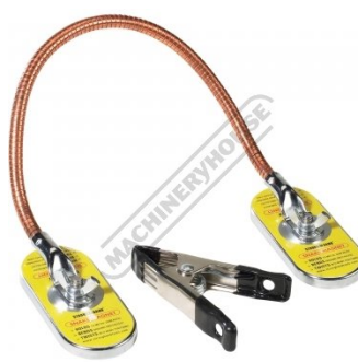
W1005 Snake Magnet & Spring Clamp