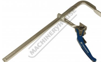
C0015 Ratchet F Clamp