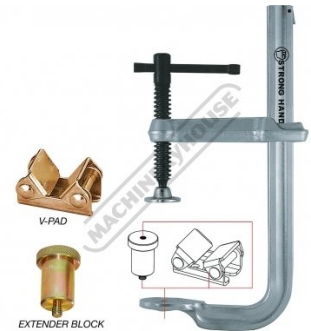
W1028 4 In One Utility Clamping System