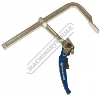
C0012 Ratchet F Clamp