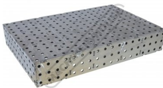
W07832 CertiFlat fabBLOCK 3D Welding Table Top