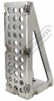
W08171 CertiFlat FabSquare