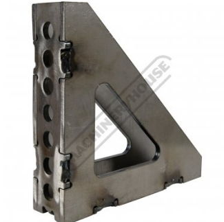
W08161 CertiFlat FabSquare