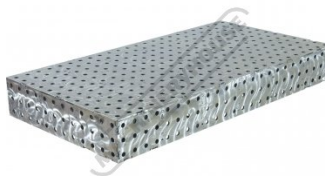
W07834 CertiFlat fabBLOCK 3D Welding Table Top