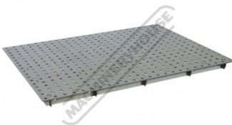
W07803 CertiFlat PRO 1D Welding Table Top