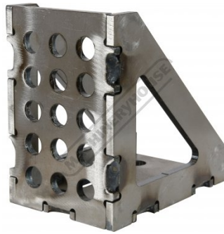
W08170 CertiFlat FabSquare