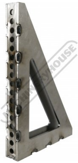
W08165 CertiFlat FabSquare