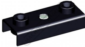
W07897 FixturePoint Threaded Adaptor