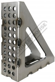
W08172 CertiFlat FabSquare