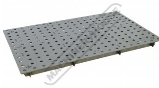
W07801 CertiFlat PRO 1D Welding Table Top