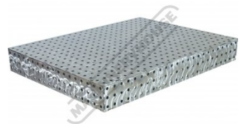
W07840 CertiFlat fabBLOCK 3D Welding Table Top