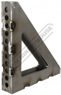
W08164 CertiFlat FabSquare