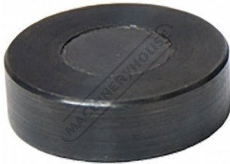
W08030 BuildPro Magnetic Rest Button