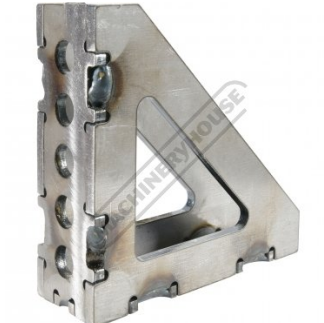
W08160 CertiFlat FabSquare