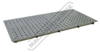
W07802 CertiFlat PRO 1D Welding Table Top