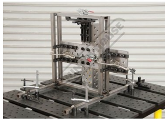
Precision Ground Steel