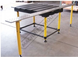
Use to Extend the Length or Width of the BuildPro Table