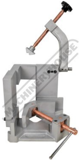
Shown with Top Clamp in Upright Position