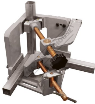
Shown With Box Tubing