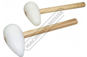
H890 Nylon Bossing Mallet Set - Radius Ends