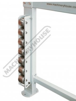
Roller Storage Rack