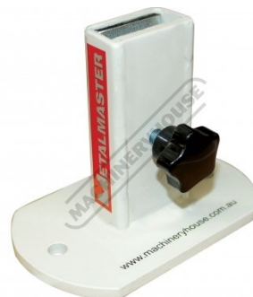
S2239 Dolly Stand Holder