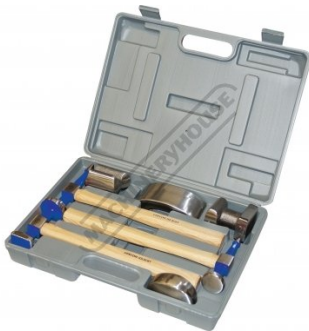
H885 Auto Panel Restoration Kit - DIY