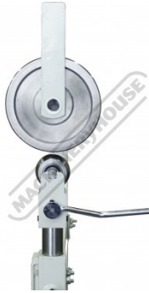
Roller End View Close Up