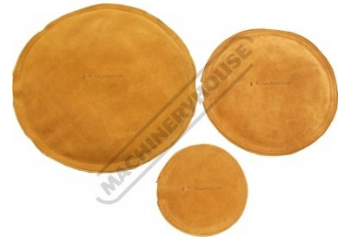
S210 Round Leather Bags - Sand