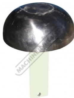
S2237 Bowl Steel Dome Dolly