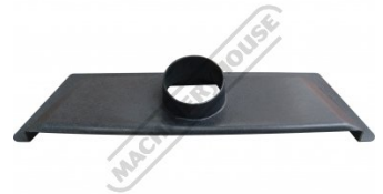
W339 Dust Hose Floor Sweeper Attachment