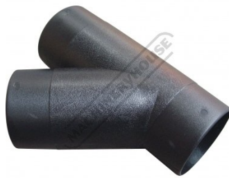
W337 Dust Hose Y Adaptor