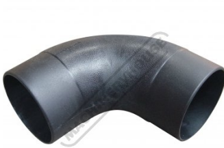
W336 Dust Hose Elbow