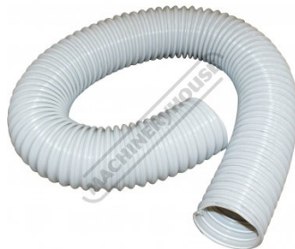
W398 Dust Hose - Timber Only