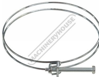
W341 Dust Hose Clamp