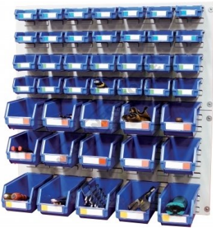
Tools Not Included