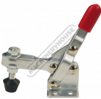
C1001 Vertical Toggle Clamp