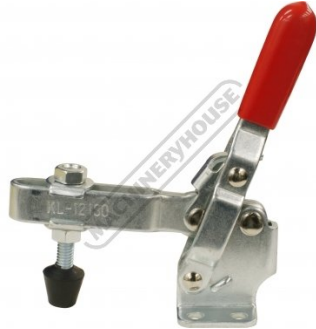
C100 Vertical Toggle Clamp