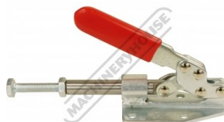
C1008 Straight Line Toggle Clamp