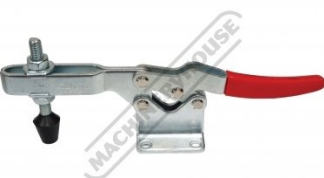
C1006 Horizontal Toggle Clamp