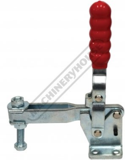
C0998 Vertical Toggle Clamp