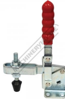
C0999 Vertical Toggle Clamp