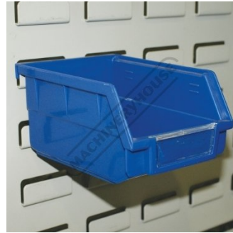
Shown with Optional Buckets