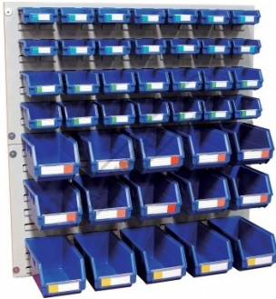
Shown with Optional Buckets on Panels